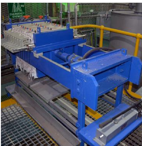
Plate and Frame Filters

Como can supply a range of high quality plate and frame filters for your plant, including sludge collection filters for recovery of dendritic sludge from your 'sludging' electrowinning process, or as an optional addition for collection of fine carbon from a Transfer Water Tank.