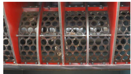
Interchangeable selection screen