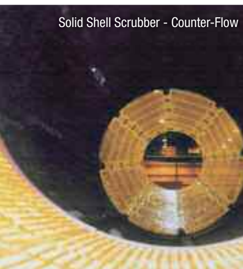
Solid Shell Scrubber - Counter-Flow

When you install a machine into a critical part of your operation, it must be reliable and able to withstand the rigors of continuous operation, sometimes 24 hours a day, seven days a week. McLanahan understands these needs and that is why McLanahan Rotary Scrubbers are built to last. Building its first rotary equipment in 1895, McLanahan has earned the reputation for being “reliable, rugged, stout and designed to last forever.” However, that is not enough! McLanahan has pushed ahead with new innovative designs and process ideas, always searching for ways to include modern componentry and features that make your operation more profitable. Rotary Scrubbers come in many styles and configurations. Partner with McLanahan and its vast rotary experience to ensure that the correct machine is selected for your application.