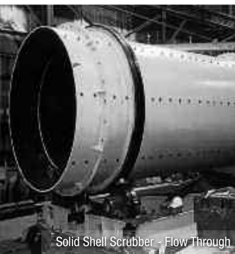
Solid Shell Scrubber - Flow Through